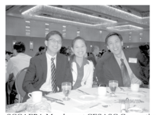
SCCAEPA Members at CESASC Convention