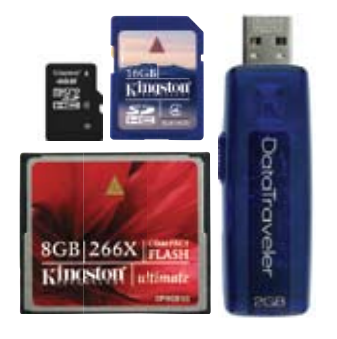
Kingston microSDHC Class 4, SDHC Class 4, CompactFlash Ultimate cards and DataTraveler 100