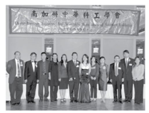
CESASC Members at the 2009 Convention