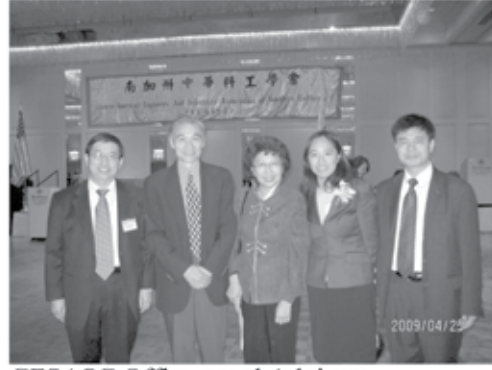
CESASC Officers and Advisors