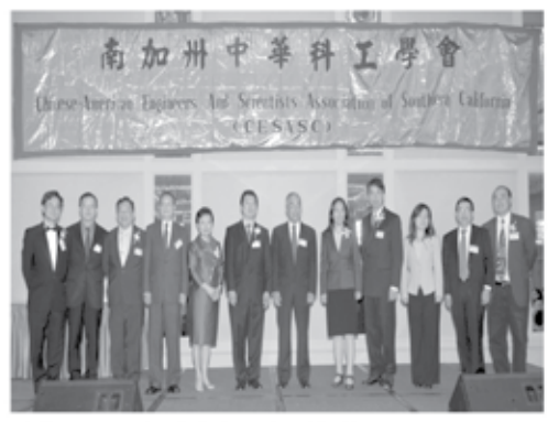
2009 CESASC Board of Directors