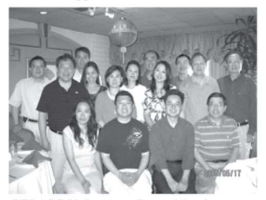
CESASC Volunteers Group Meeting